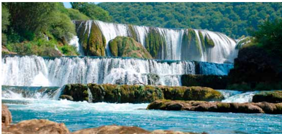
Una National Park, BiH © Zeljko Mirnović-Grga