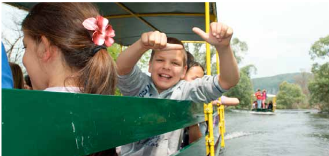
European Day of Parks, Hutovo Blato Nature Park, BiH